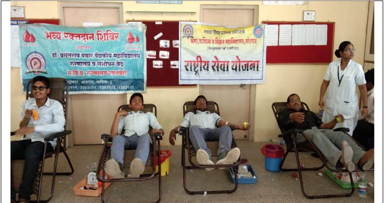
Students & Teachers Participated in Blood Donation Camp on 20/01/2019