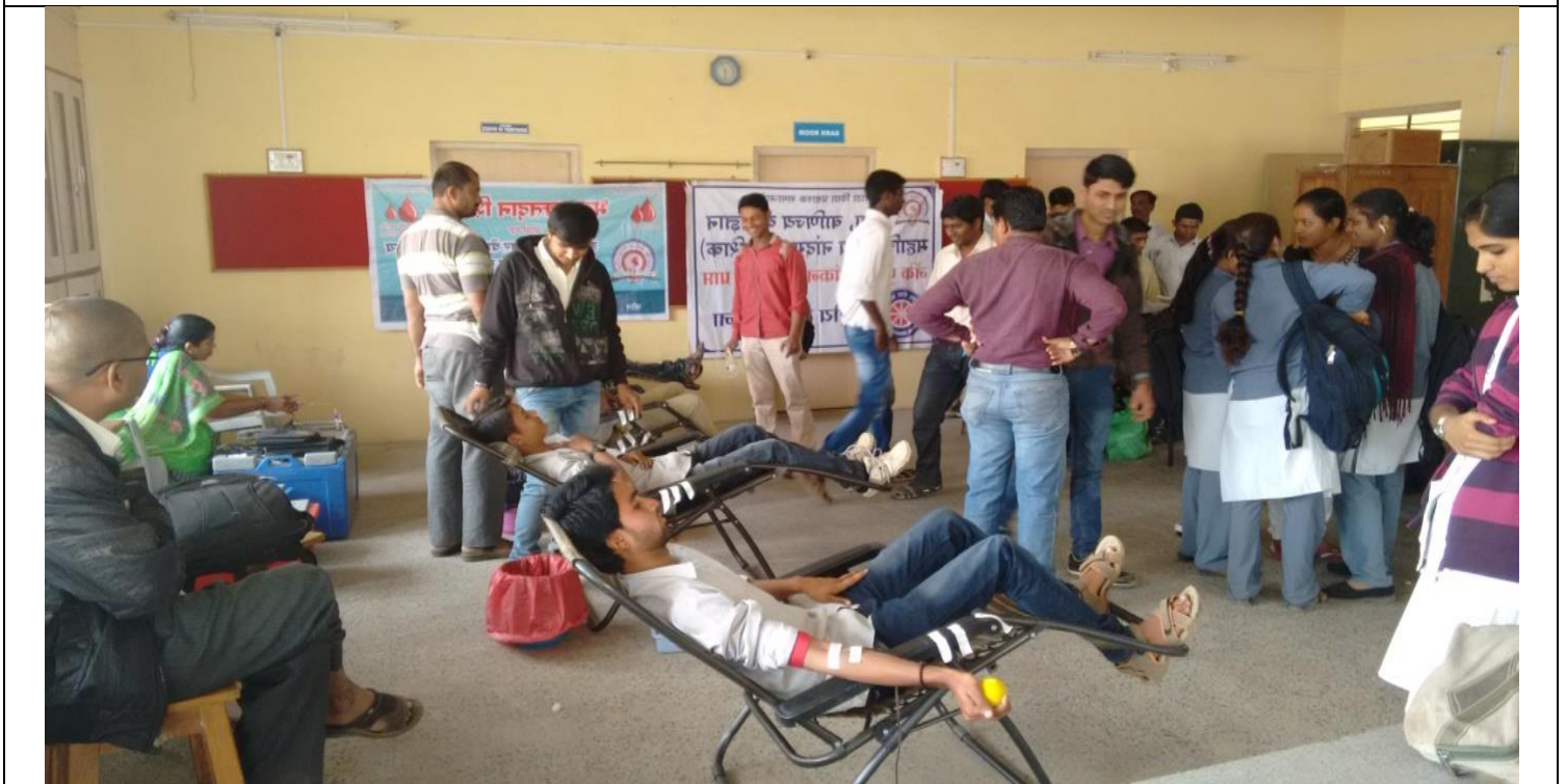
Students & Teachers Participated in Blood Donation Camp on 20/01/2019