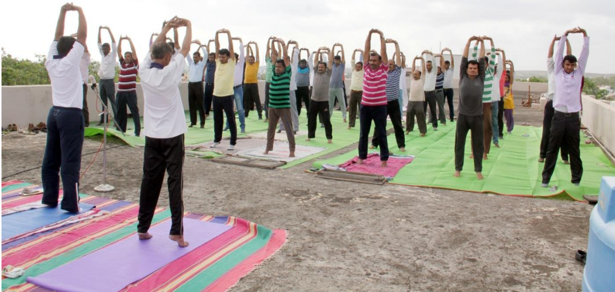
Students & Teachers Participation in Yoga day on 22/06/2017