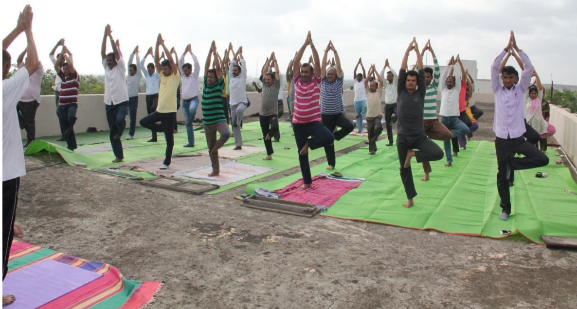
Students & Teachers Participation in Yoga day on 22/06/2017