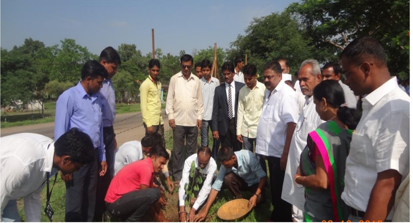
Plantation on occasion of World Environment Day on 05/06/2018